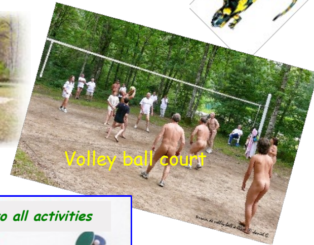
Volley ball court