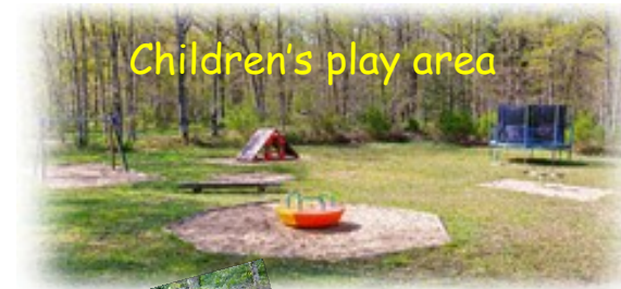
Children's play area