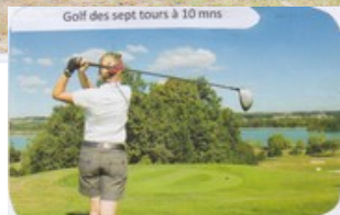
Golf des sept tours à 10 mins