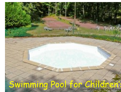
Swimming Pool for Children's